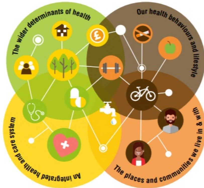
Figure 2: Population health model (Kings Fund, 2019)

The priorities in South Warwickshire Place have been aligned to the Population Health Management approach, this directly support the ICS aim of looking to improve outcomes in population health through the foundations of Place-based Partnerships.